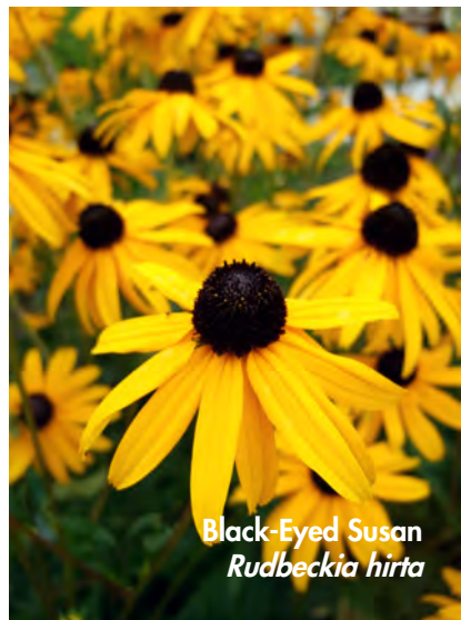
Black-Eyed Susan Rudbeckia hirta